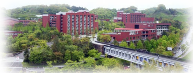
▲ Kakuma Campus North Area

This organization's expenses shall be paid using the revenue from its activities and donations. Core alumni associations may be requested to bear necessary expenses after consultations with the general assembly meetings of officers, but in principle, registered alumni associations may not have obligation to bear any expenses.