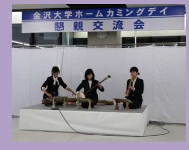
Performance by Koto Shakuhachi Club